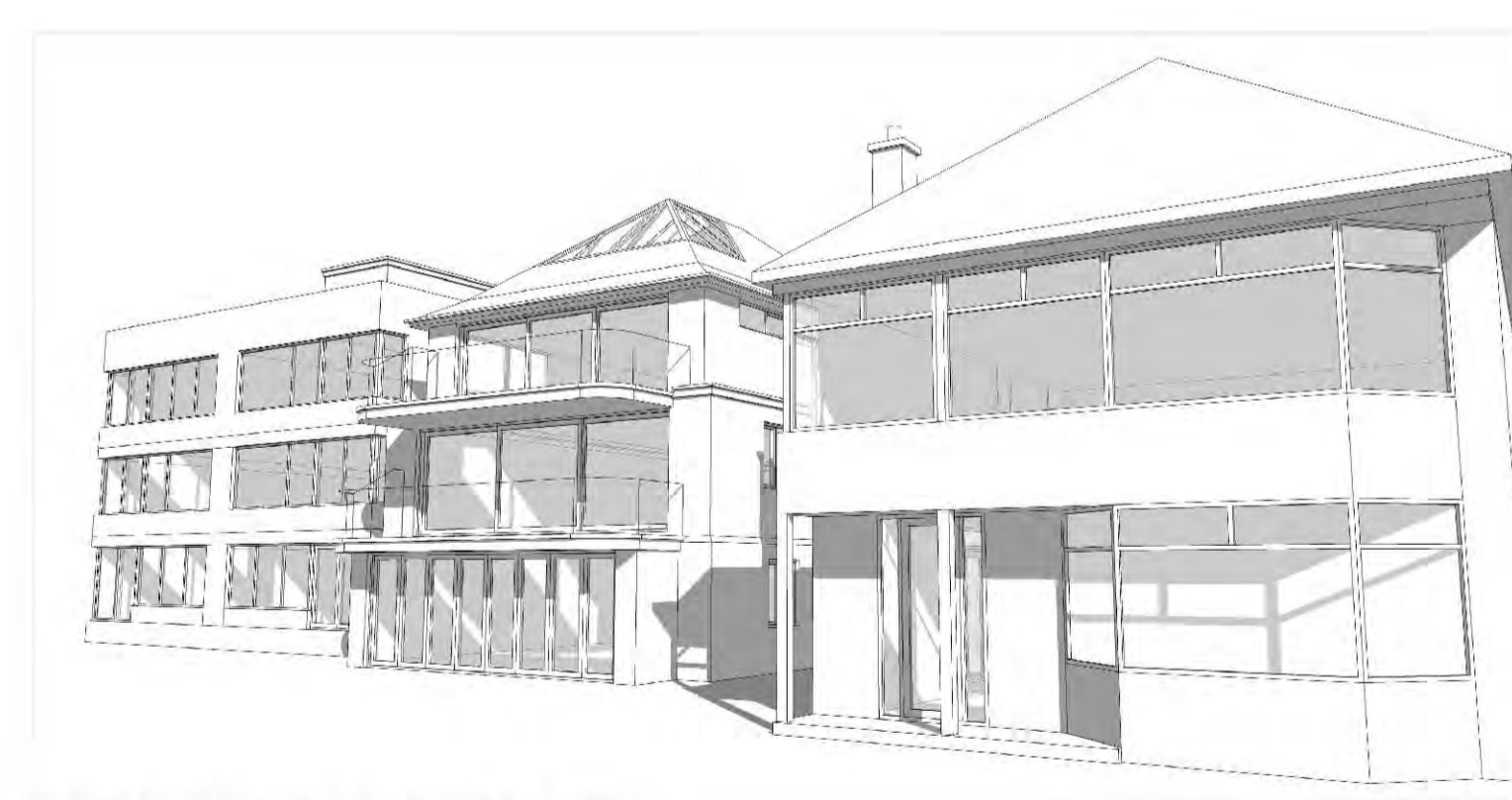
VIEW TOWARDS VICEROY COURT