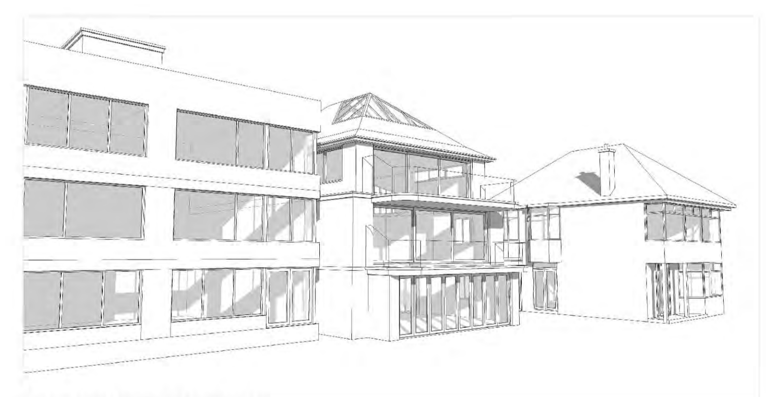
VIEW TOWARDS NUMBER 37